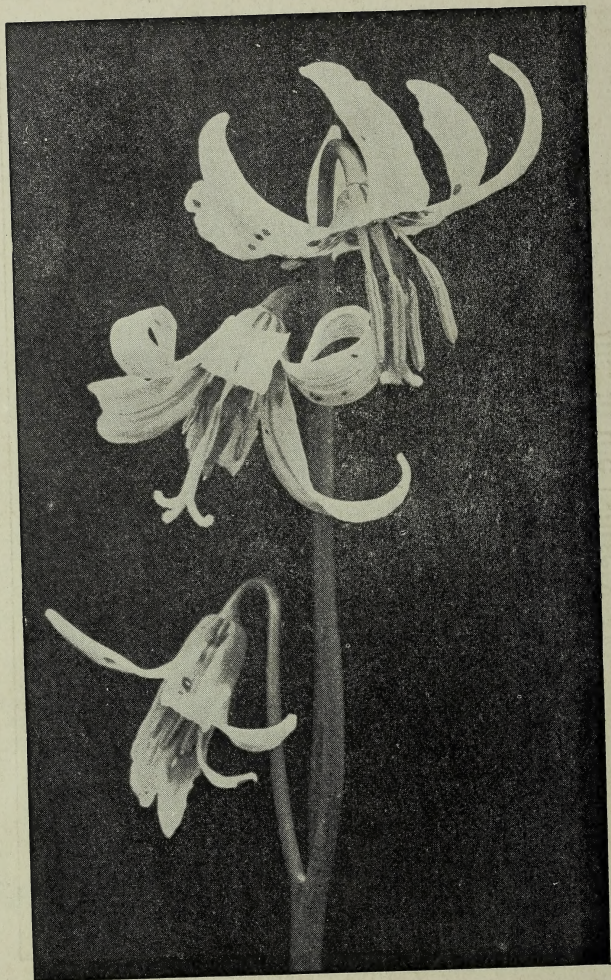
Erythronium, or Dog's Tooth Violet